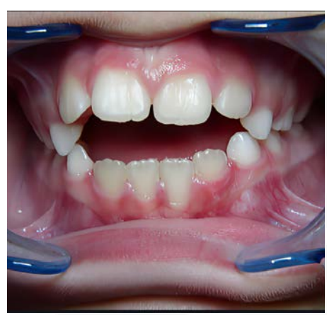
Open-mouth posture with lips apart