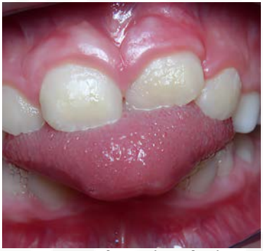
Tongue thrusting during speaking and swallowing

Above mentioned oral habits characterize Myofunctional disorders. Such disorders can lead to a disruption of normal dental development in both children and adults.