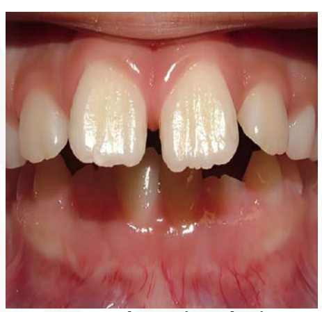
Tongue thrusting during speaking and swallowing

Research examining various populations found 38% have orofacial Myofunctional disorders and, as mentioned above, an incidence of 81% has been found in children exhibiting speech/articulation problems.