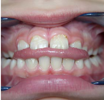
Open-mouth posture with Forward rest posture of the tongue